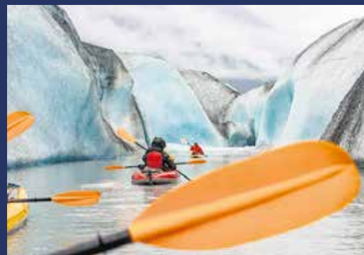
Ice pack On an expertly led ship's kayaking expedition